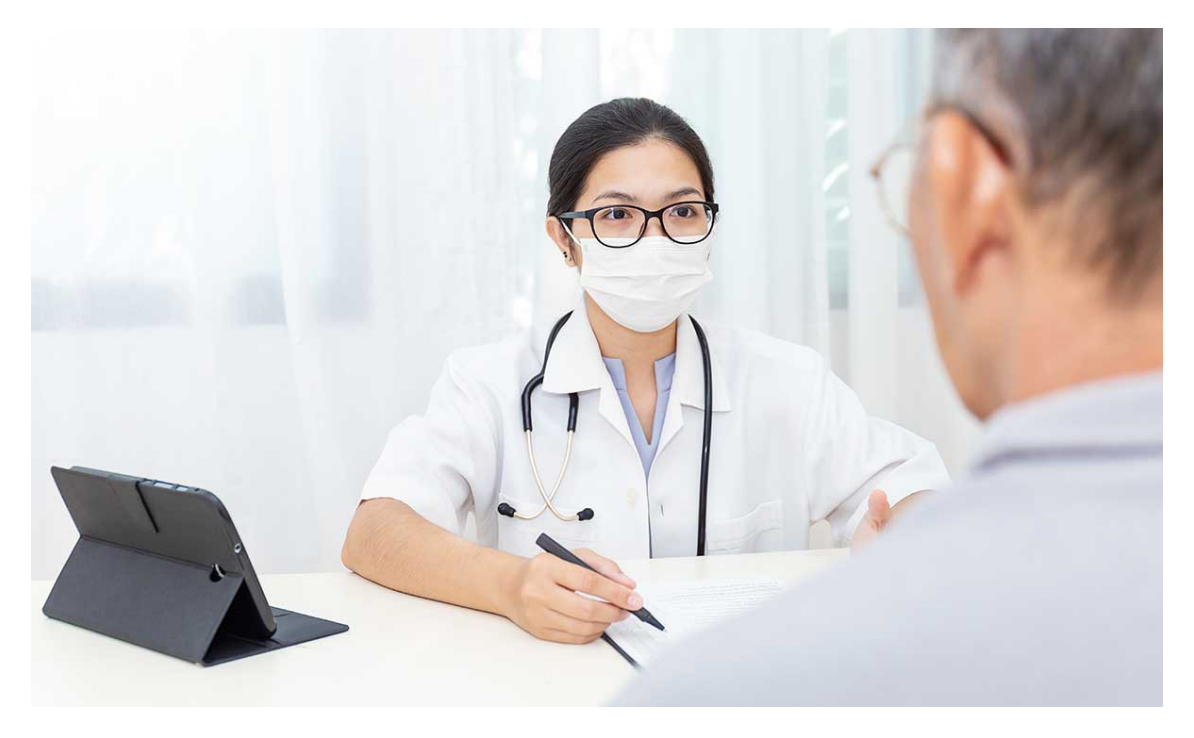
By Shelly Weatherly, JD

As state and local authorities permit your practice to reopen, it is imperative that you implement processes that ensure the safety and health of your employees and patients. Our new checklist is provided in furtherance of our commitment to support you during this uncertain time. There is no one-size-fits-all solution, so we encourage you to adapt this tool to your individual practice needs.