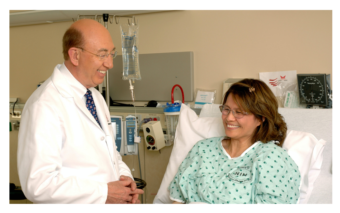
By Jeffrey A. Woods, JD

Informed consent is often the most important discussion that physicians will have with their patients, but unfortunately, it is sometimes viewed as merely obtaining a signature on a pre-printed form. While lack of informed consent is rarely the central issue in a malpractice lawsuit, it is almost always included as an additional allegation. For this reason, it is important to keep in mind that, while the physician may be assisted by other healthcare professionals in providing consent-relevant patient education and/or obtaining a signature on the consent form, the individual who actually renders the care is legally and ethically responsible for providing the information upon which the consent is obtained. What does this mean? When a lack of informed consent claim is alleged, it will typically be asserted against the physician and not the nurse or non-physician staff who obtained the signature on the form. From a risk management perspective, the informed consent process plays a vital role in minimizing exposure to medical negligence lawsuits because it involves patients in their medical treatment and helps keep expectations realistic.